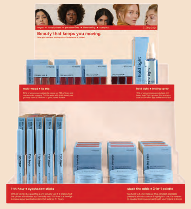
14.75" W x 8" L x 19.75" H