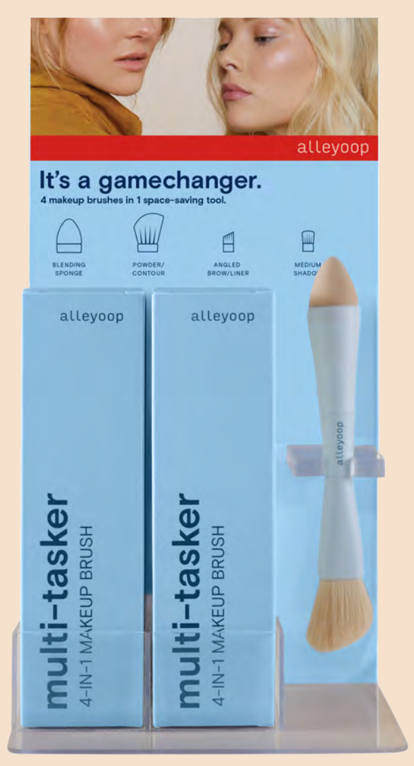
7" W x 5" L x 13.25" H