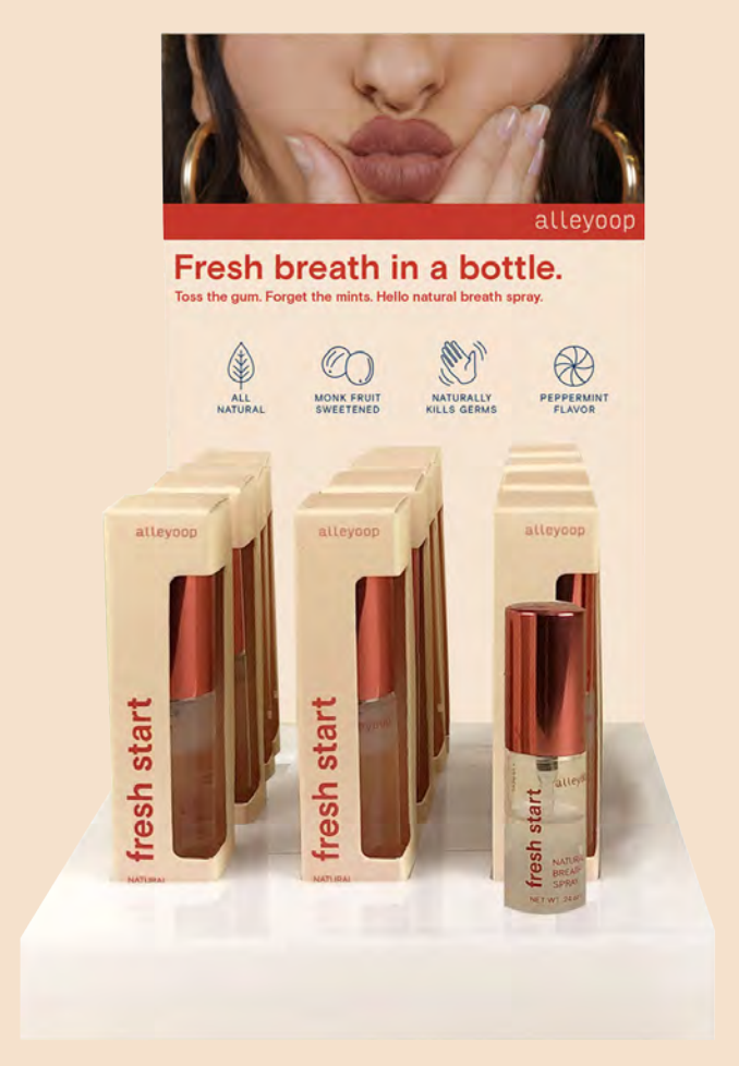
5.75" W x 7.125" L x 9.75" H