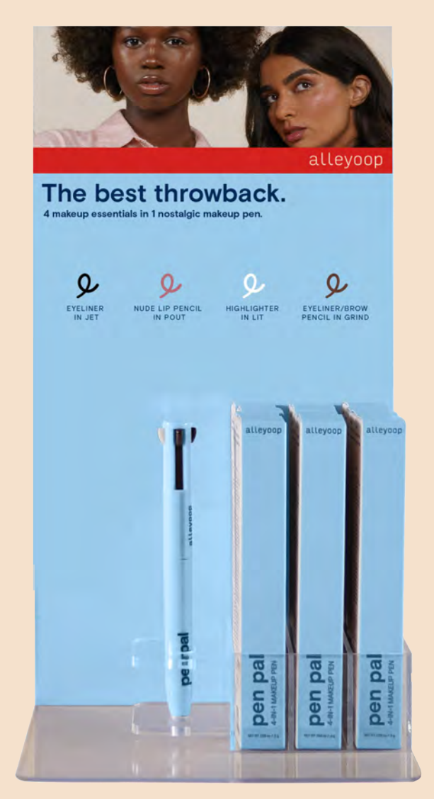
7" W x 5" L x 13.25" H